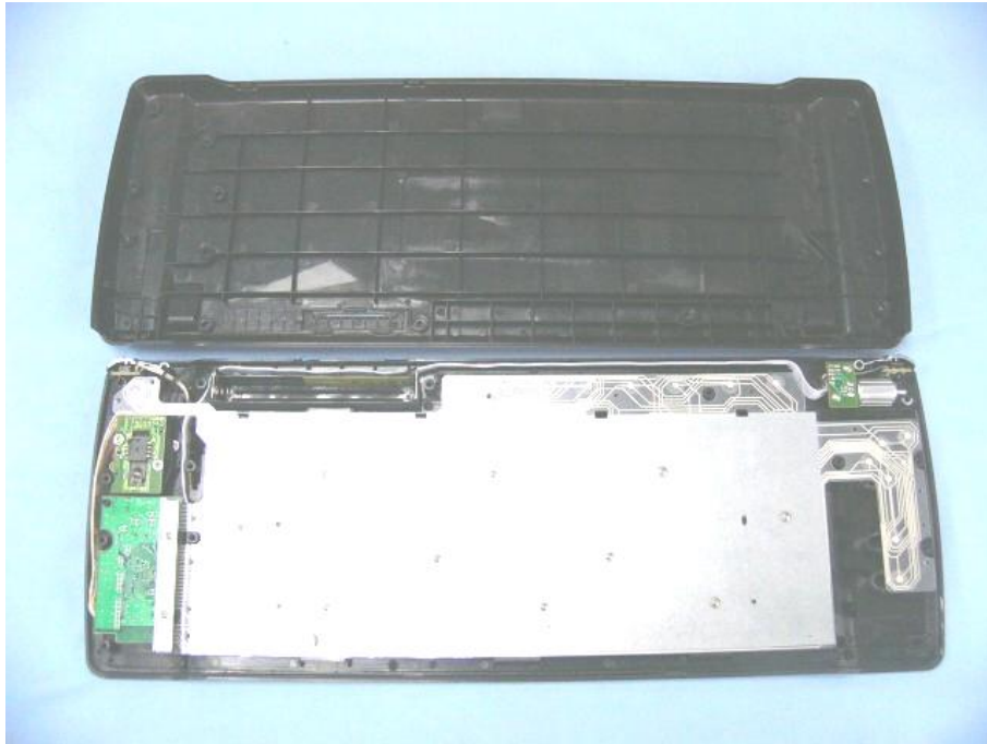
Main & RF board component side