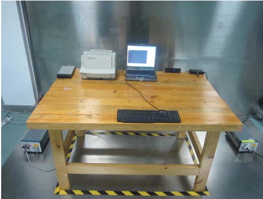
Conducted Emission - Side View