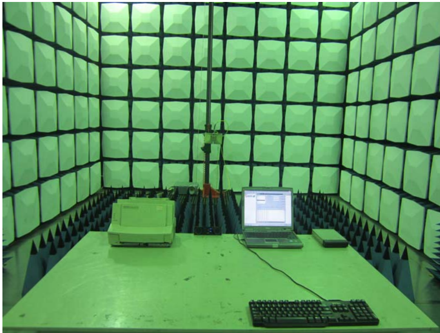
Radiated Emission-Rear View (Above 1 GHz)