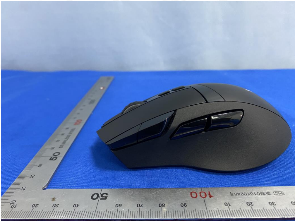
PORT VIEW OF EUT