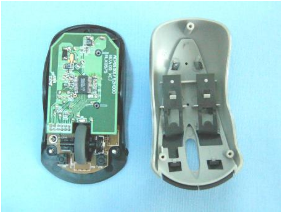
Main board component side