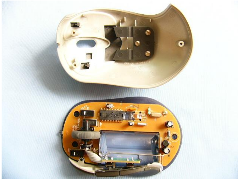
Main board component side