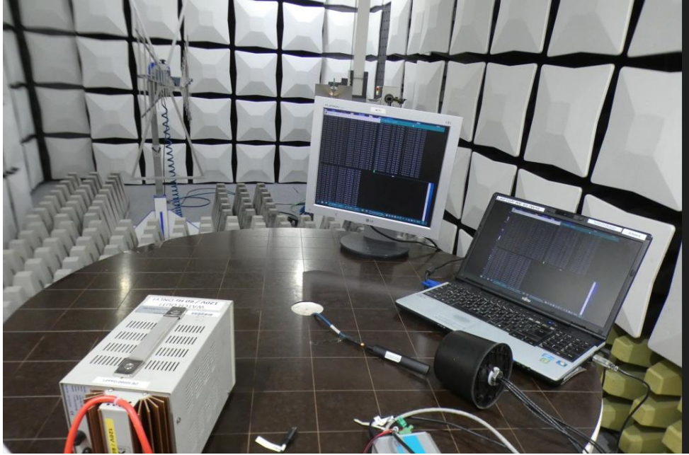
Photo 3: Test setup for radiated measurements FCC15b, 18 GHz – 40 GHz