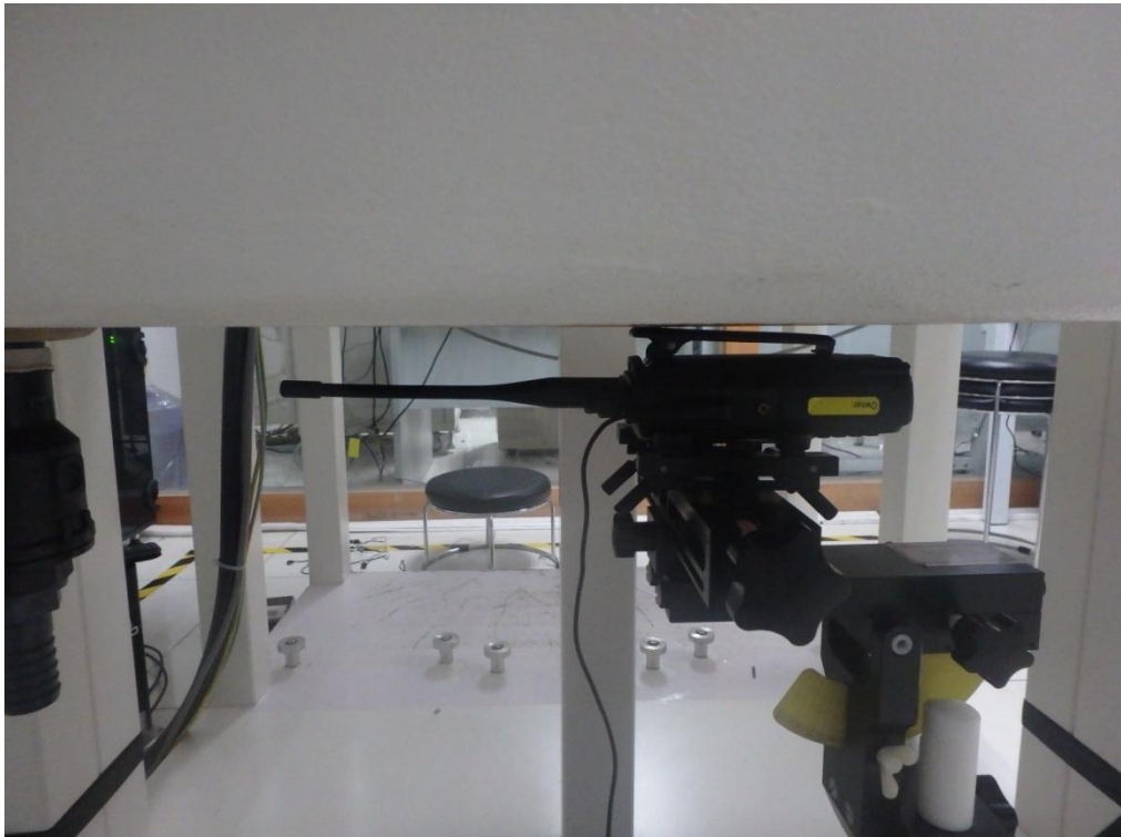
The thickness of EUT is 3.3 cm