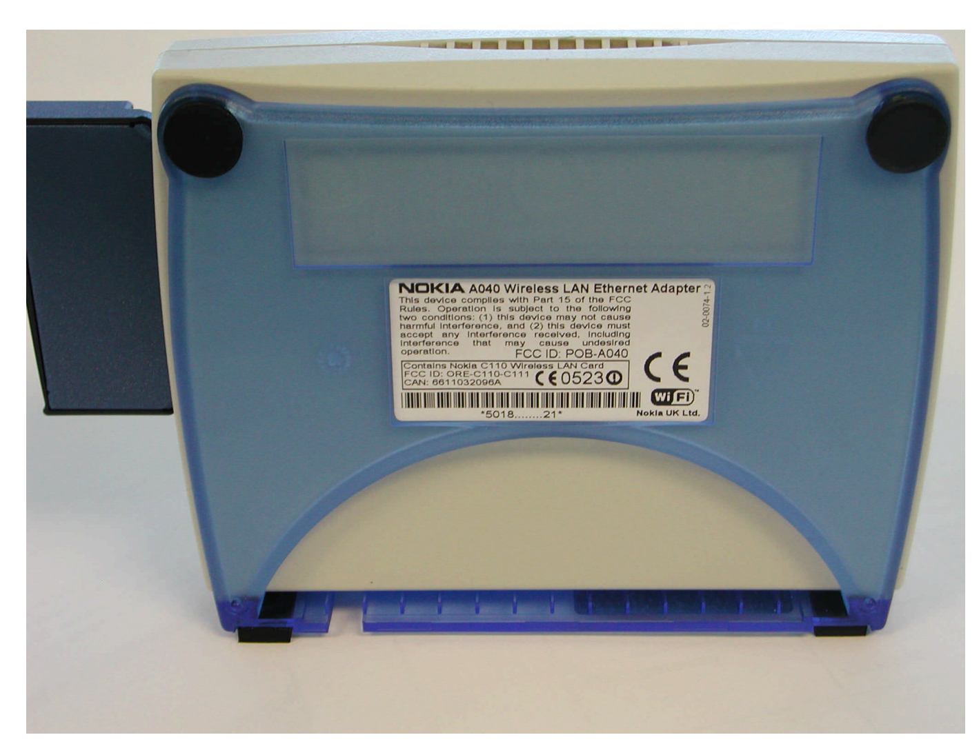
Figure 2 – A040 Label Location