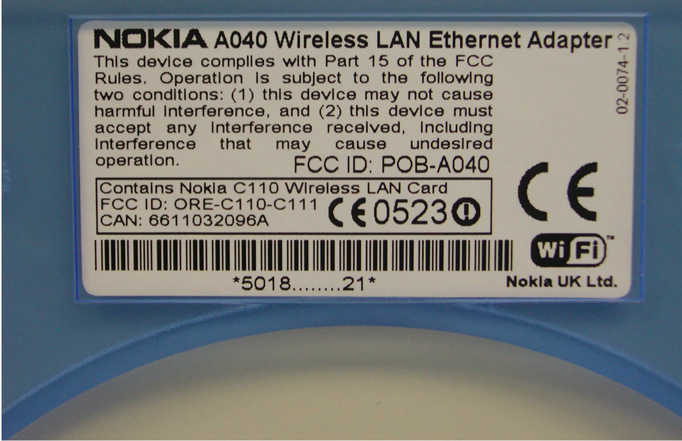
Figure 3 – A040 Label Detail (Actual Printed Label)