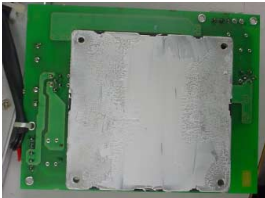
Figure 6 PCB 2 Side 2