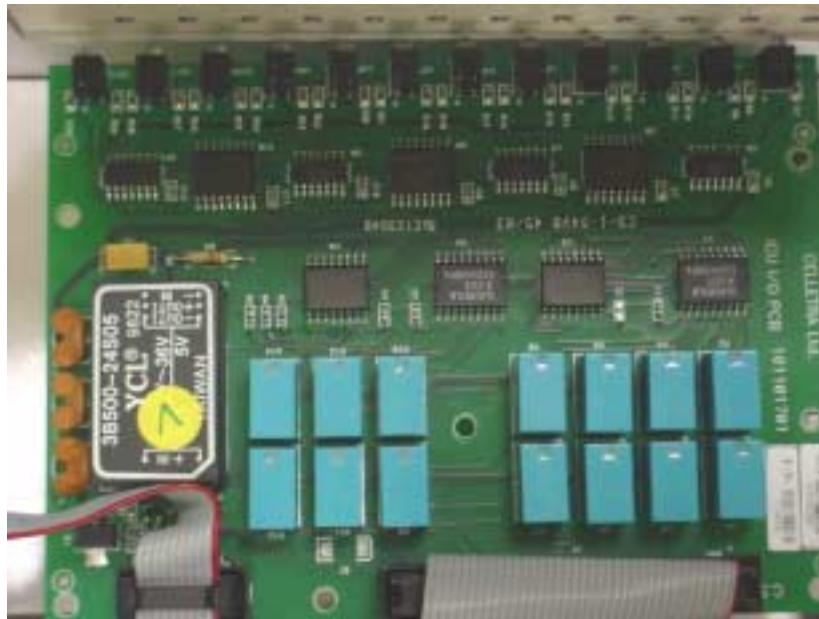
Figure 9 PCB 4 Side 1