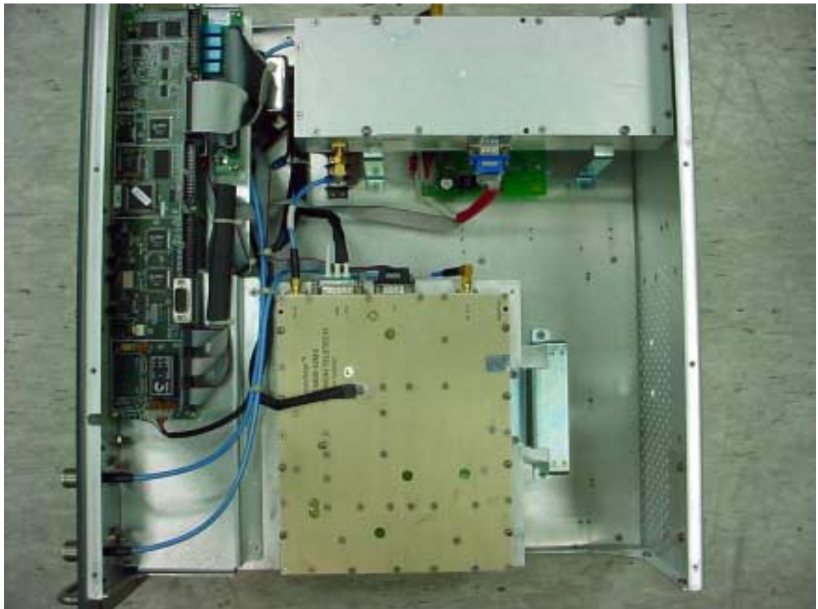
Figure 2 Internal View