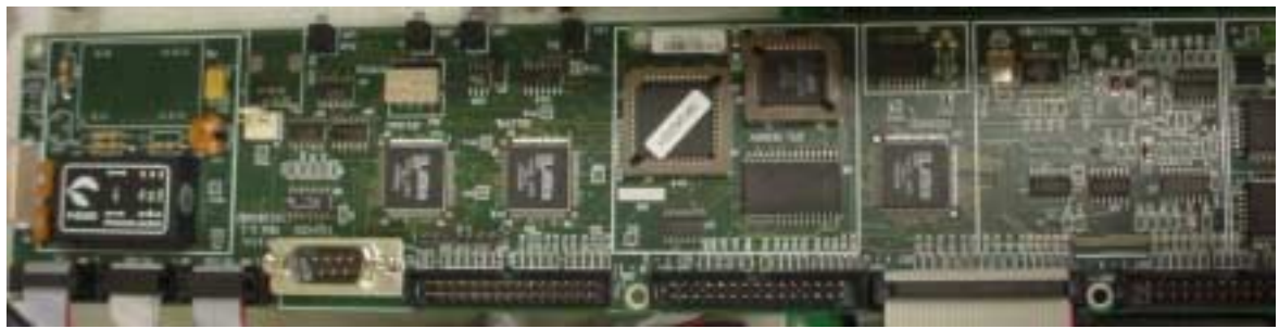
Figure 7 PCB 3 Side 1