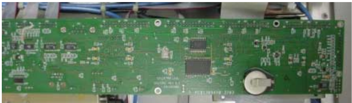
Figure 8 PCB 3 Side 2