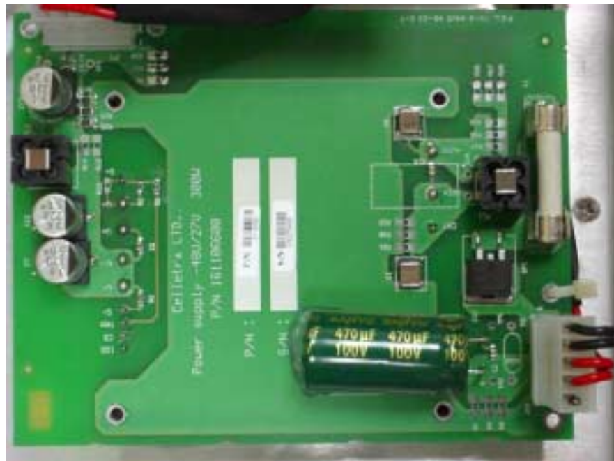
Figure 5 PCB 2 Side 1