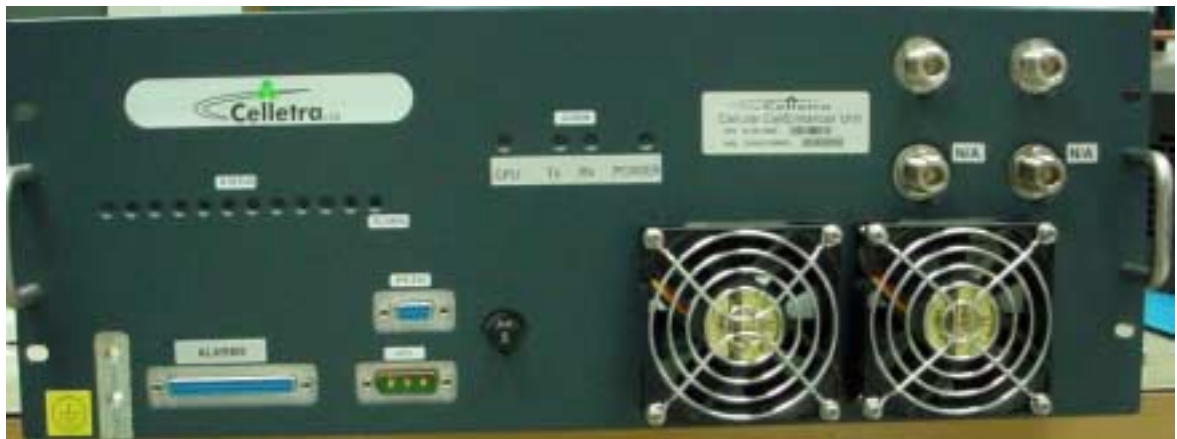
Figure 1 Front Panel