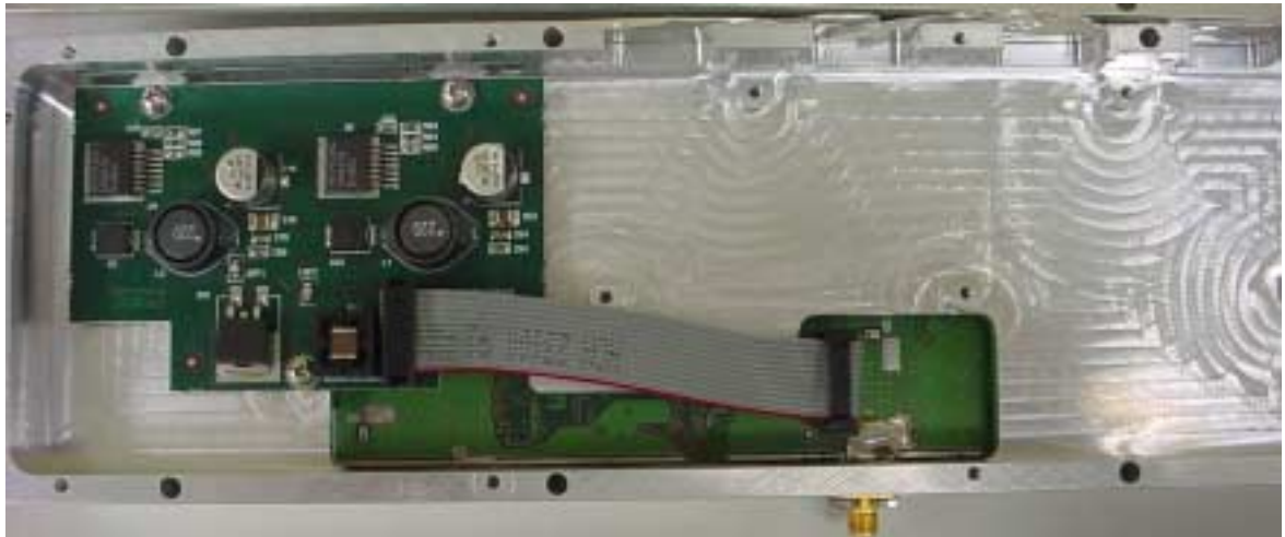
Figure 3 PCB 1 Side 1