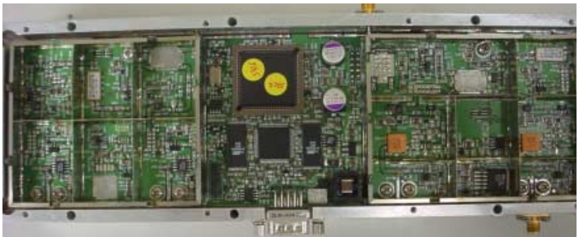
Figure 4 PCB 1 Side 2