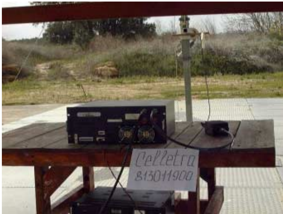
Figure 11. External View