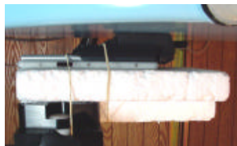
EUT with Visor Edge Back touching phantom surface