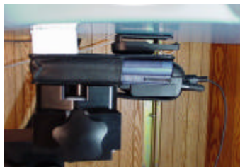
EUT with Visor Prism & Leather Holster with Belt-Clip