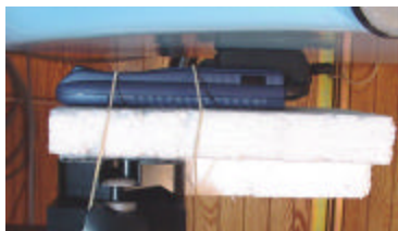
EUT with Visor Prism Back touching phantom surface