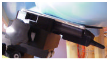
EUT with Visor Edge