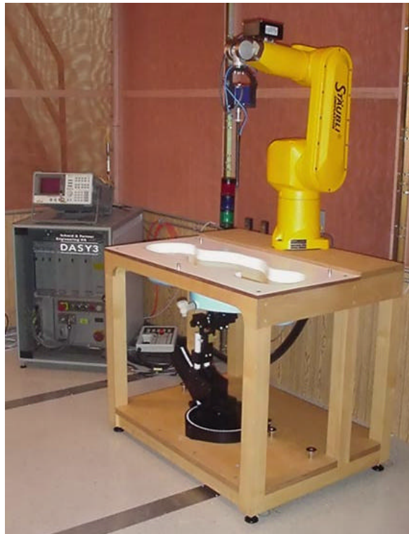
DASY3 SAR Measurement System