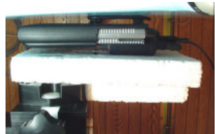
EUT with Visor Platinum & Plastic Holster with Belt-Clip