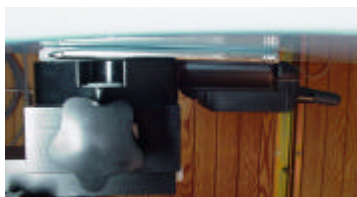
EUT with Visor Edge Front touching phantom surface