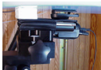
EUT with Visor Edge & Leather Holster with Belt-Clip