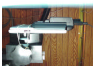
EUT with Visor Edge & 2.5cm separation distance