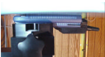
EUT with Visor Prism Front touching phantom surface