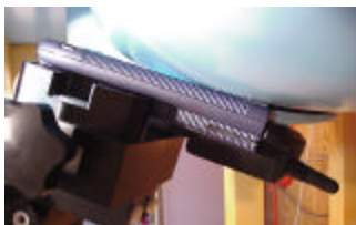
EUT with Visor Prism