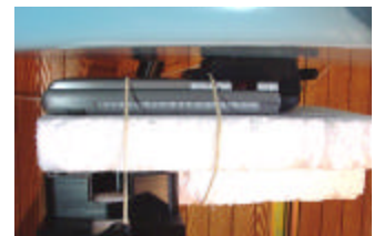
EUT with Visor Platinum Back touching phantom surface