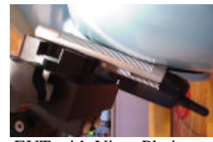
EUT with Visor Platinum