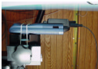
EUT with Visor Prism & 2.5cm separation distance