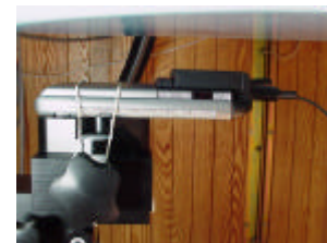
EUT with Visor Platinum & 2.5cm separation distance