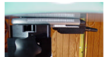
EUT with Visor Platinum Front touching phantom surface