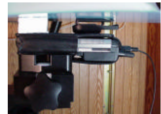
EUT with Visor Platinum & Leather Holster with Belt-Clip