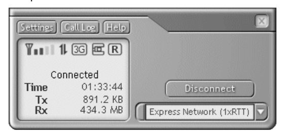
Fig 4 [File Name: UI_Connected.bmp] FOR VERIZON USE: VZW connected.bmp

4. To disconnect from the network and terminate your connection, click Disconnect .