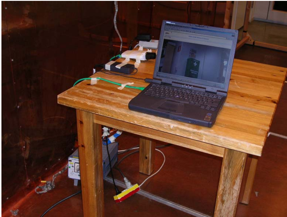
Conducted disturbance voltage at AC terminal