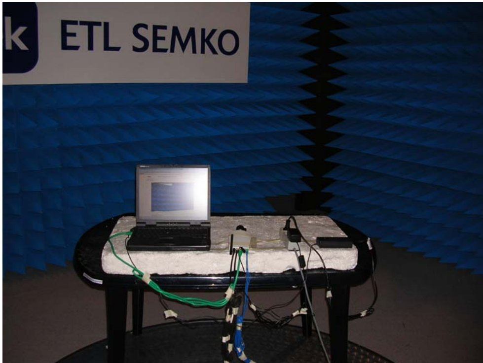
Radiated spurious emission 30-1000 MHz