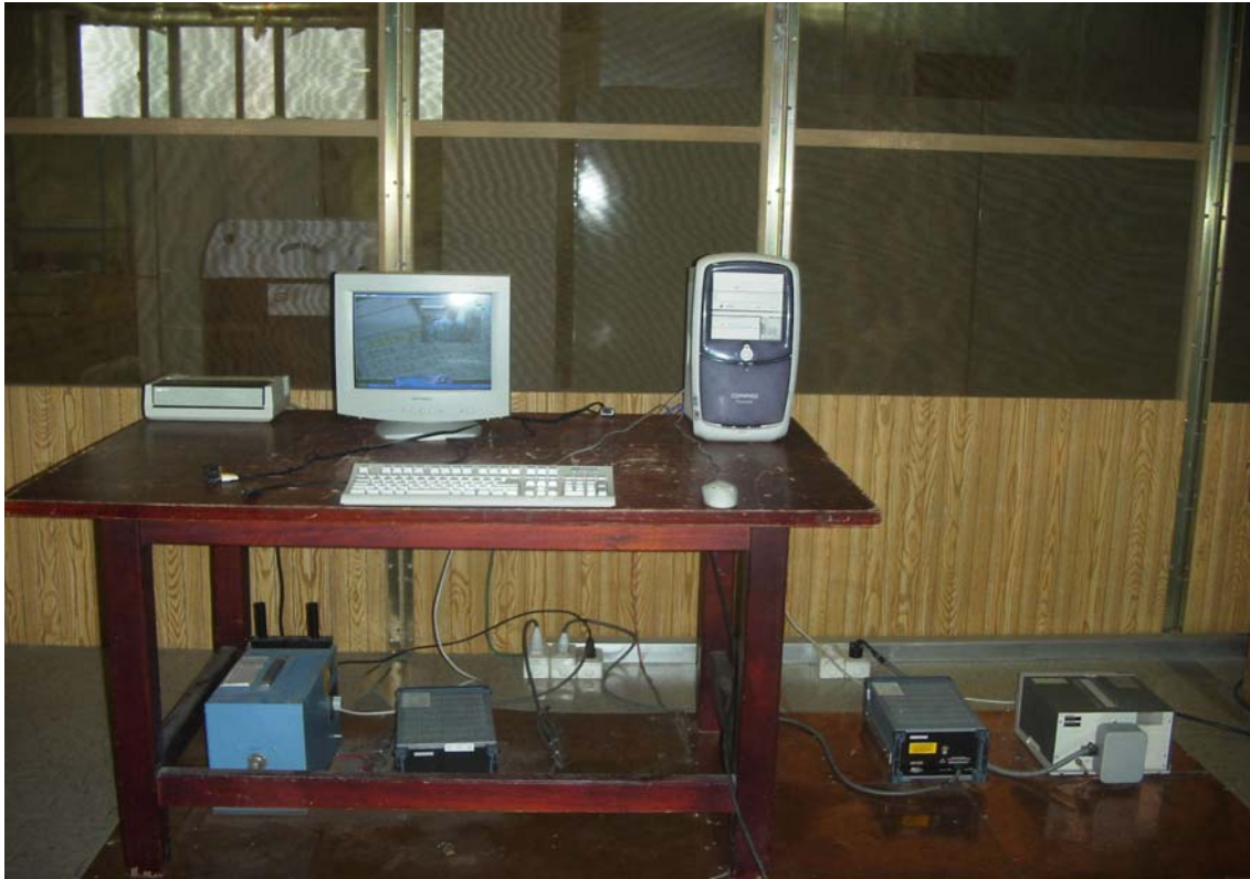
Conducted Emission 450kHz ~ 30MHz