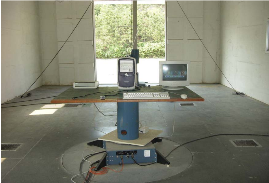
Radiated Emission 30MHz ~ 1000MHz