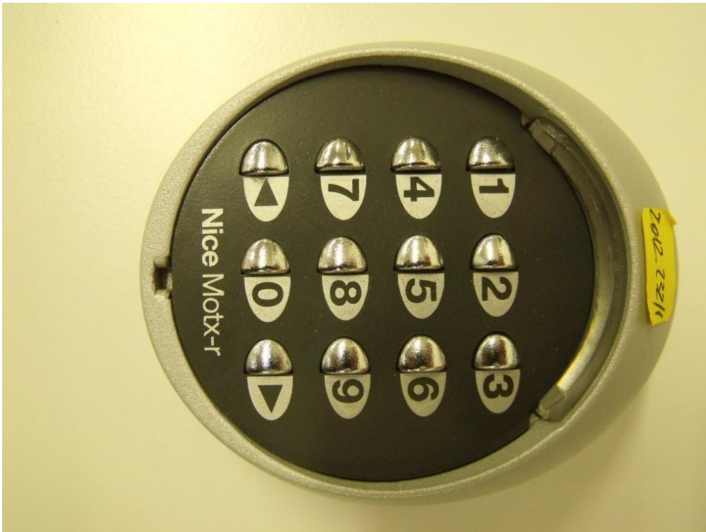
Figure 1 – product complete