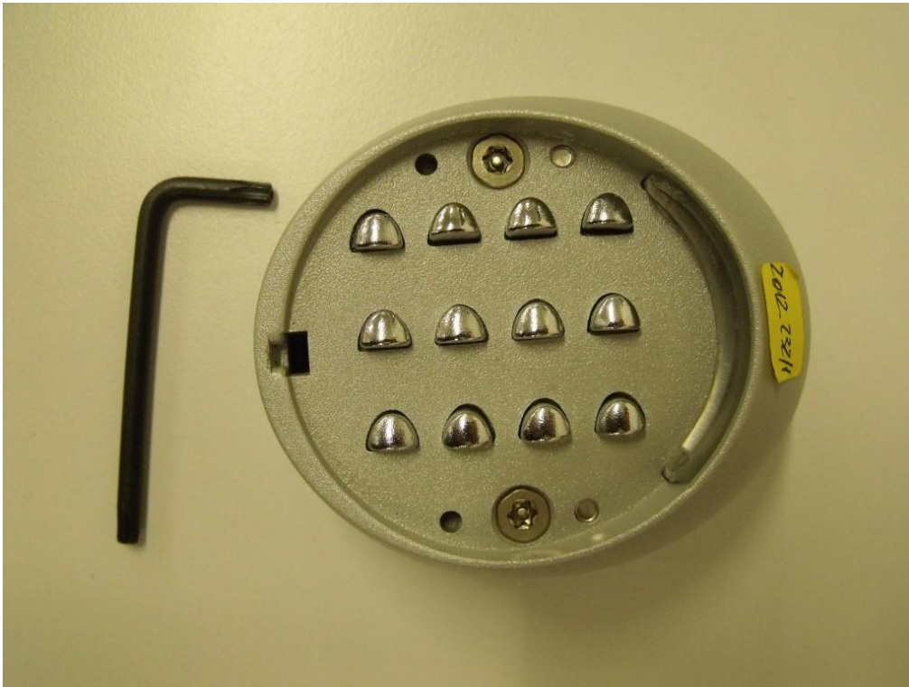
Figure 3 - the upside and backside are connected with screw. With tool is possible to separate the upside to backside