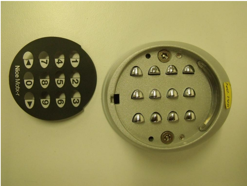
Figure 2 - Front removed