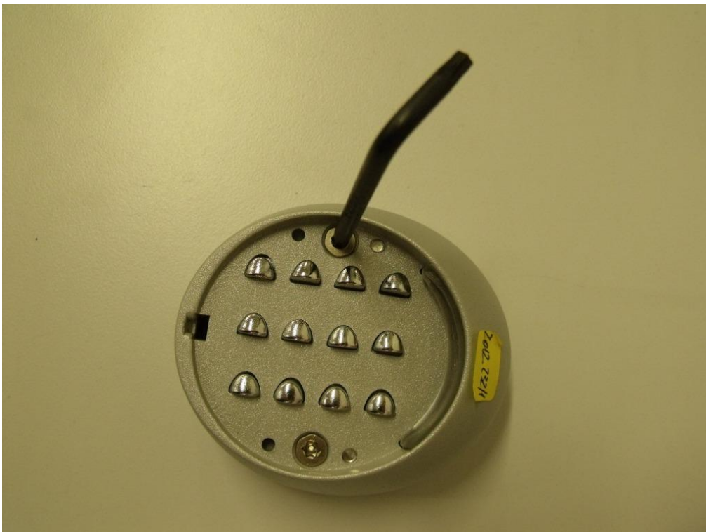
Figure 4 - remove the upside with tool