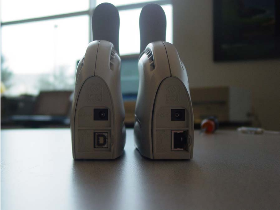
LCD Modem rear