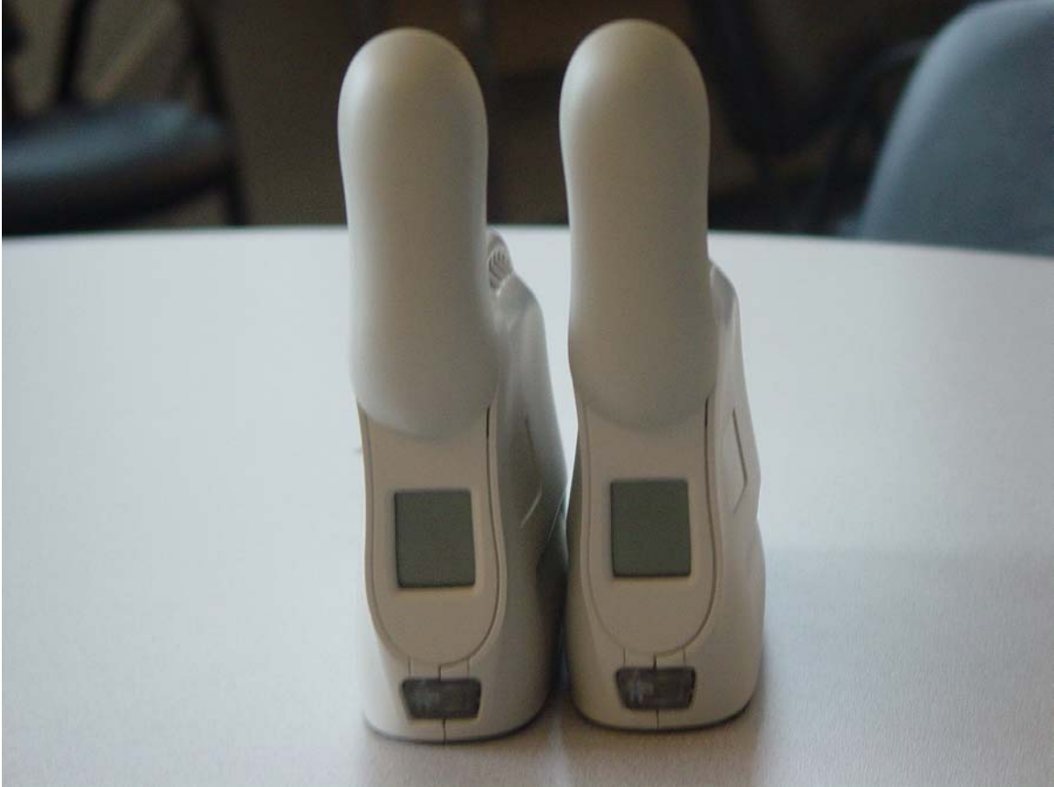
LCD Modem front