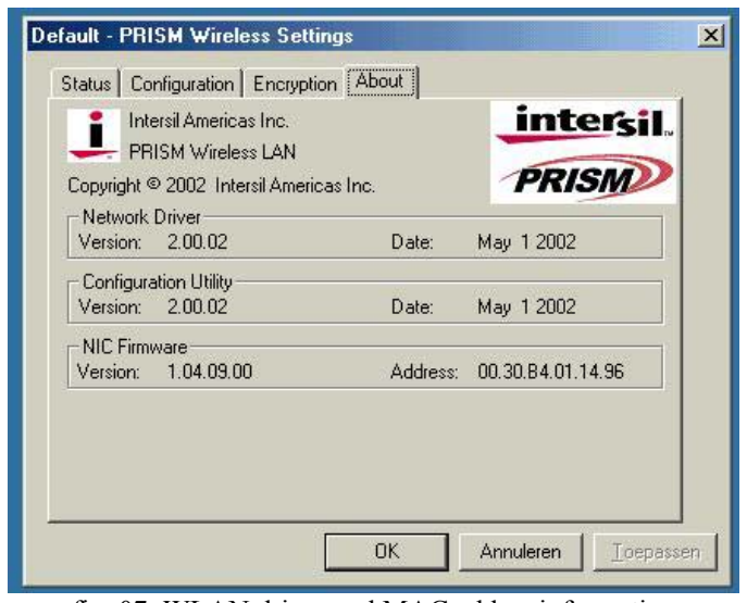
fig, 07: WLAN driver and MAC addres information

j-click on the about tab to see the software drivers versions and MAC address (fig.07).