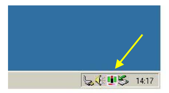
fig, 01: Intersil WLAN icon

d-the Intersil WLAN icon will appear in system tray on the bottom right of the screen (see yellow arrow in fig. 01)