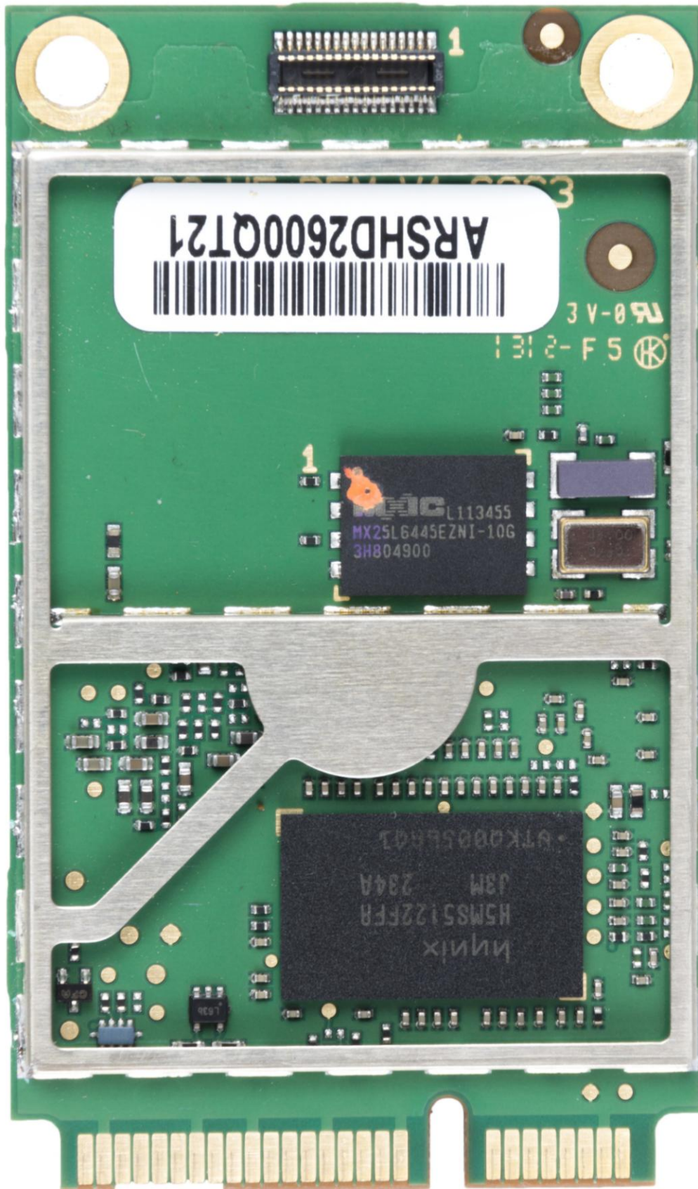
Figure 2: Bottom of Main PCB