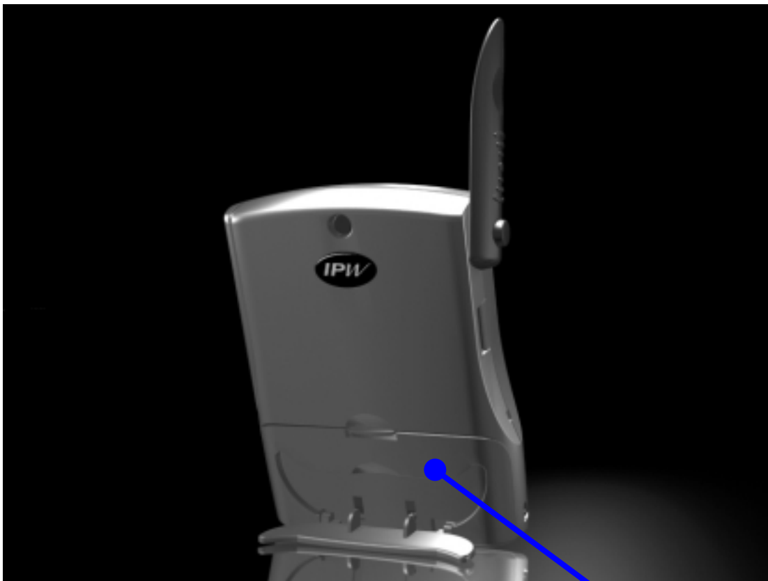
Figure 2: Position of Product & Approvals Label

Product/Approval Label part no.UEB-037-L Location beneath battery cover on PCB see below