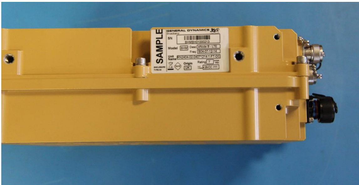
Figure 2: Detailed Label Position