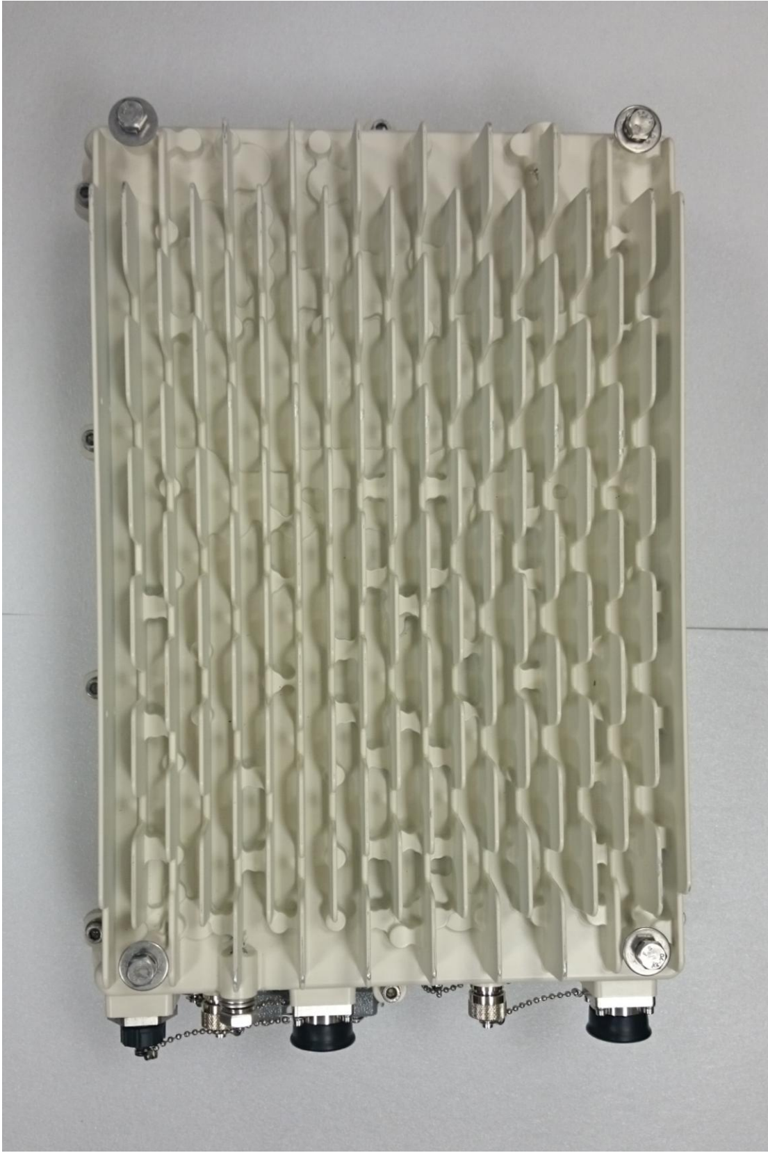
Figure 2: RN2420 eNodeB Rear View