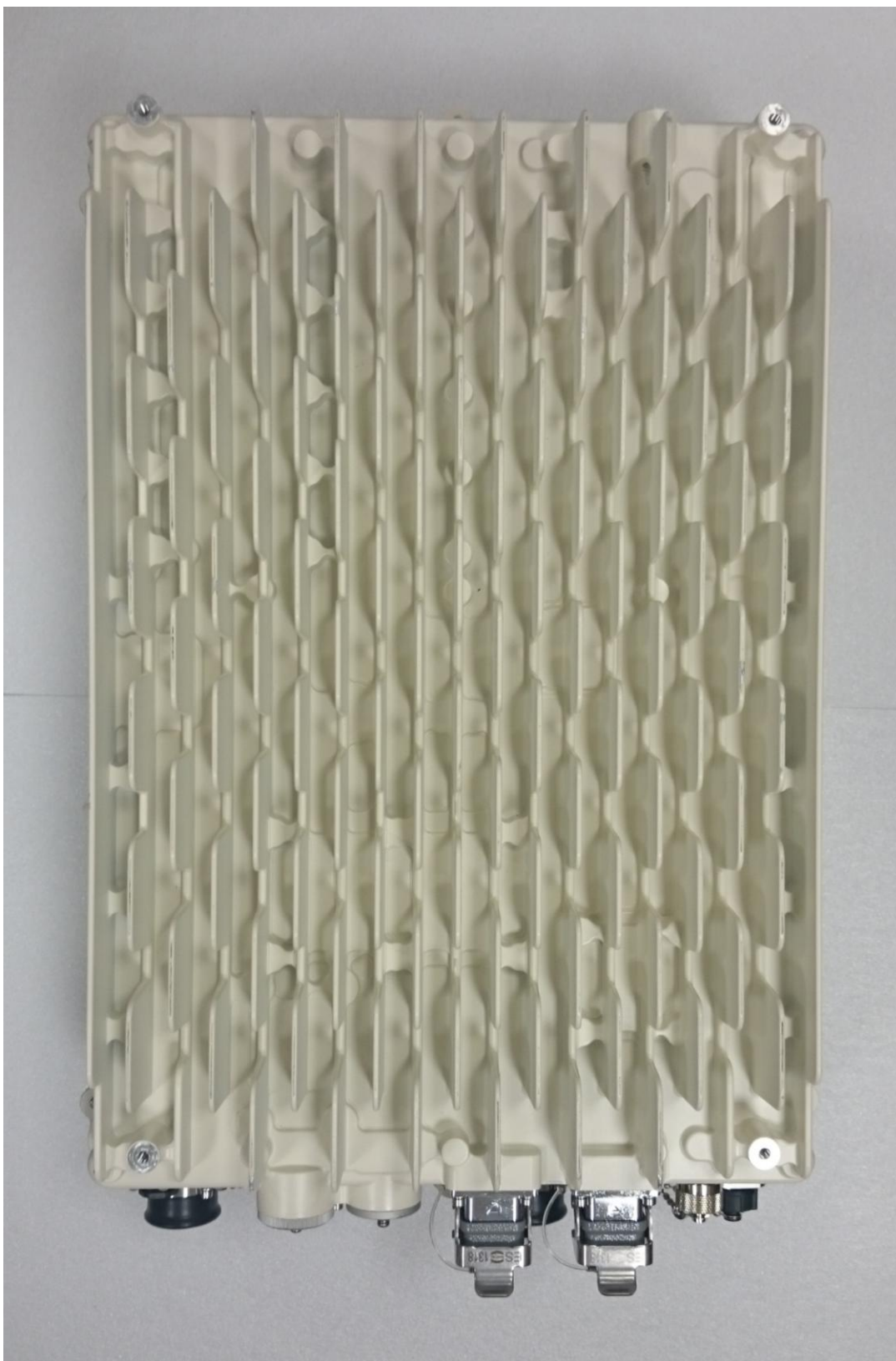
Figure 1: RN2420 eNodeB Front View