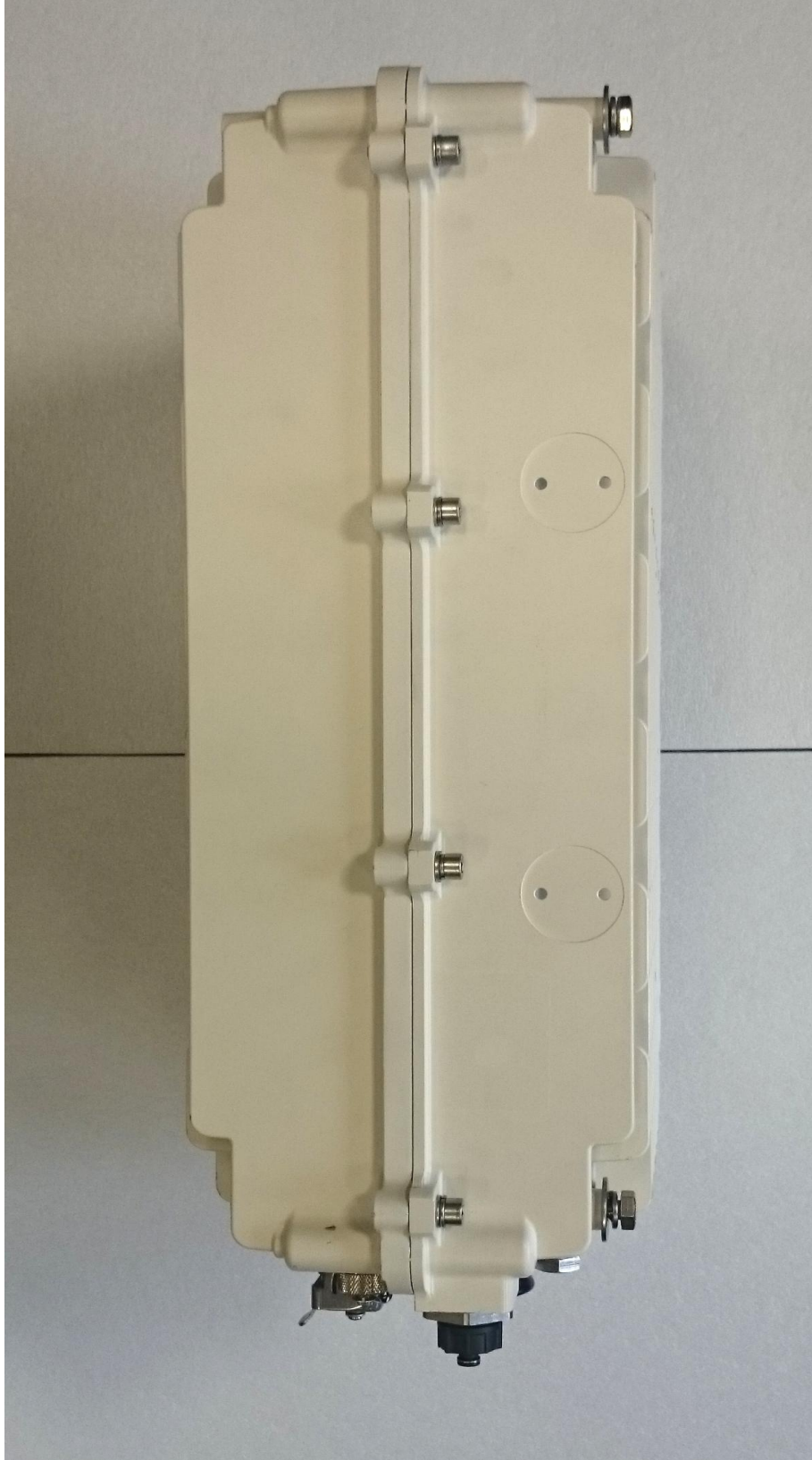
Figure 4: Side View