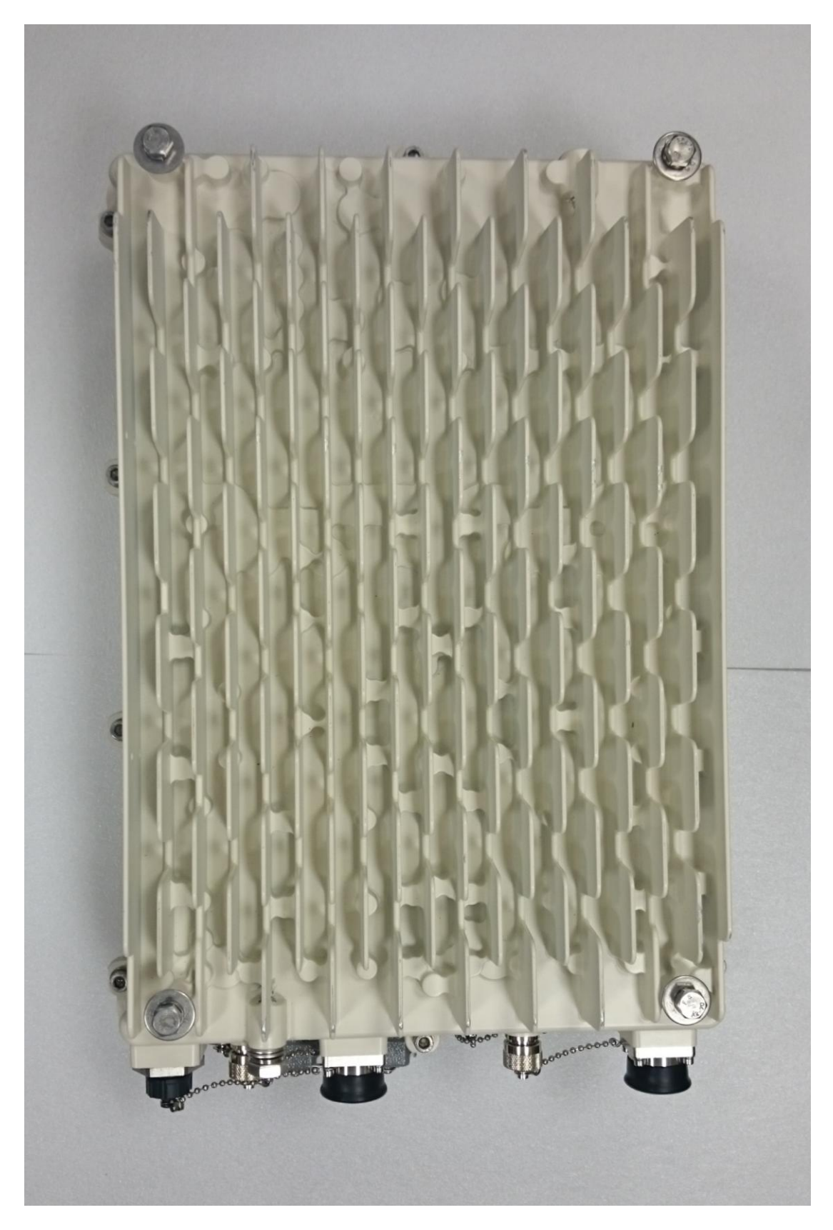
Figure 2: RN2420 eNodeB Rear View