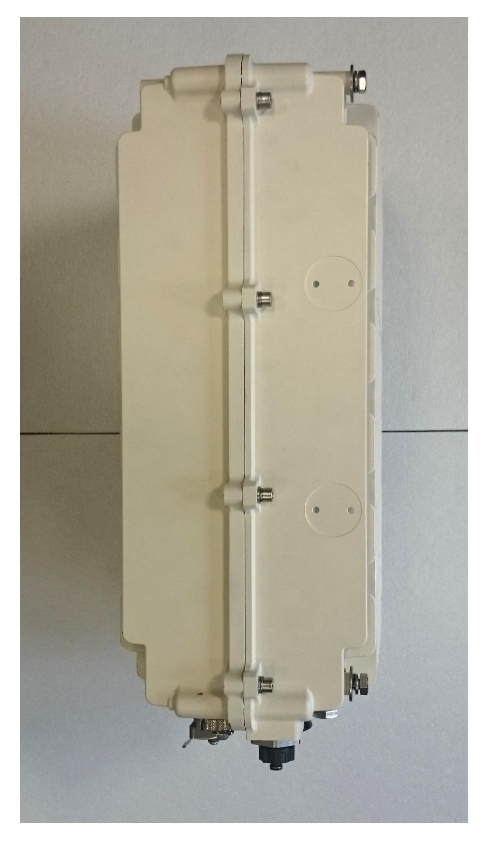
Figure 4: Side View