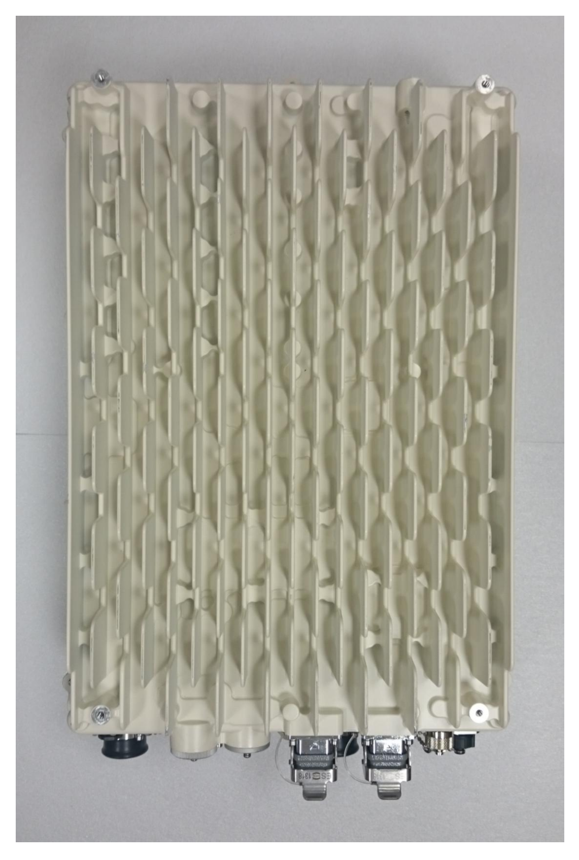
Figure 1: RN2420 eNodeB Front View