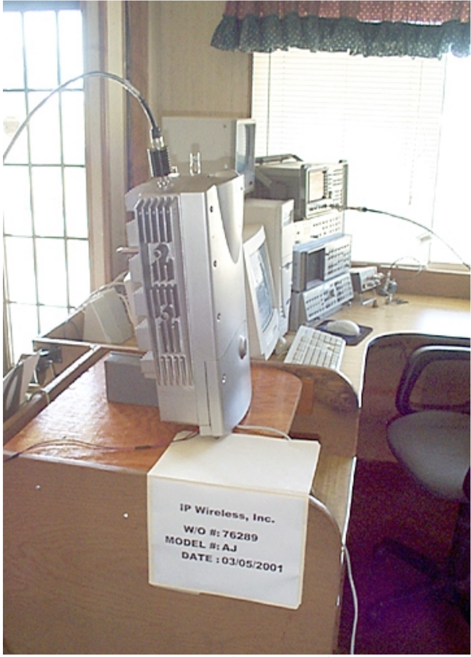
Direct Connect Testing