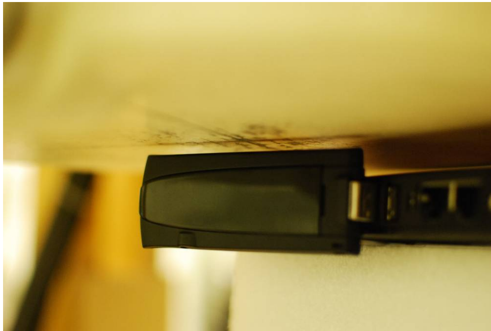
SAR Test Setup Photo 2 – Vertical Back at 0.5 cm