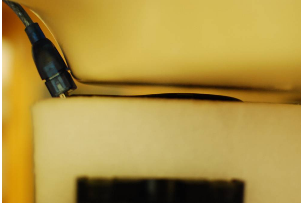
SAR Test Setup Photo 1 – Horizontal Down at 0.5 cm