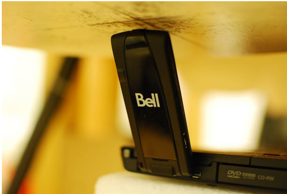
SAR Test Setup Photo 4 – Tip at 0.5 cm