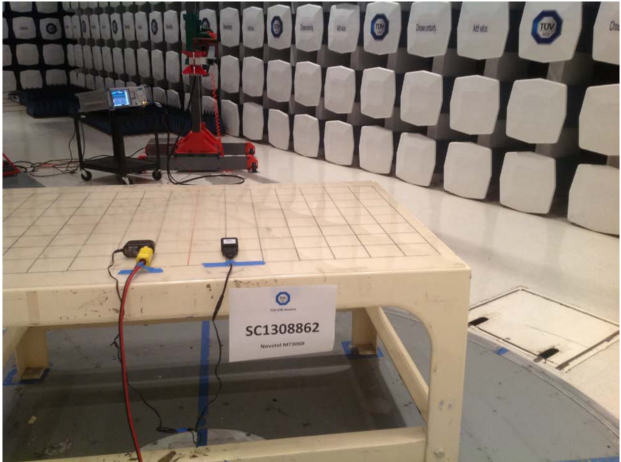
Radiated Emissions >1GHz Test Setup