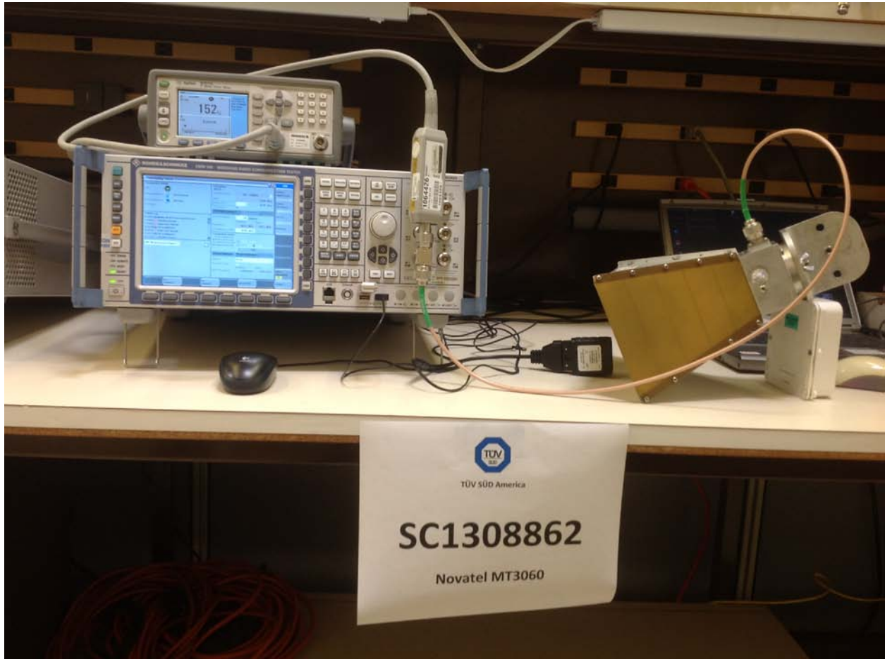
PAR Test Setup