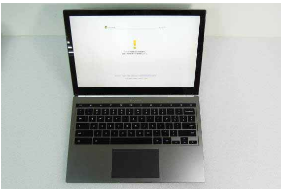
Front View of EUT-3