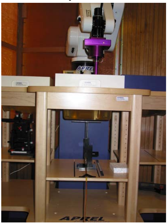
System Body Configuration