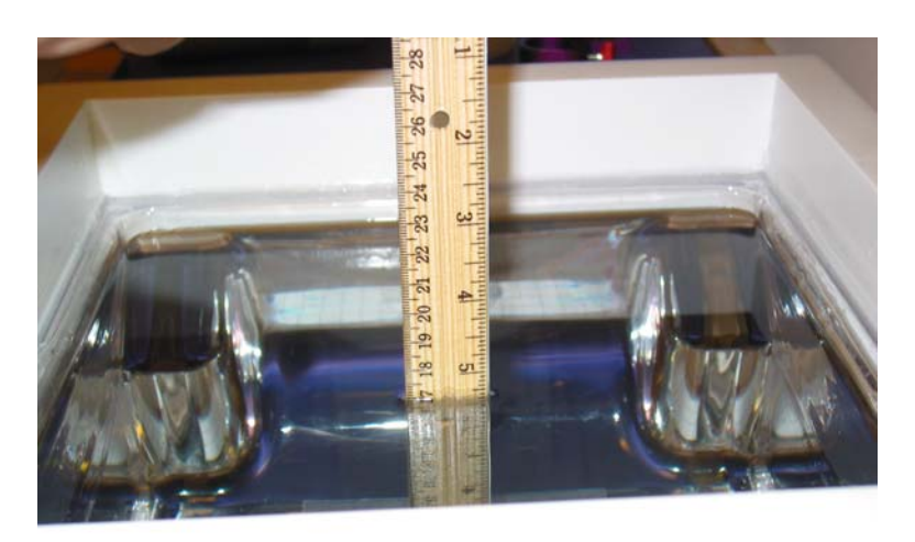
Body Tissue Depth