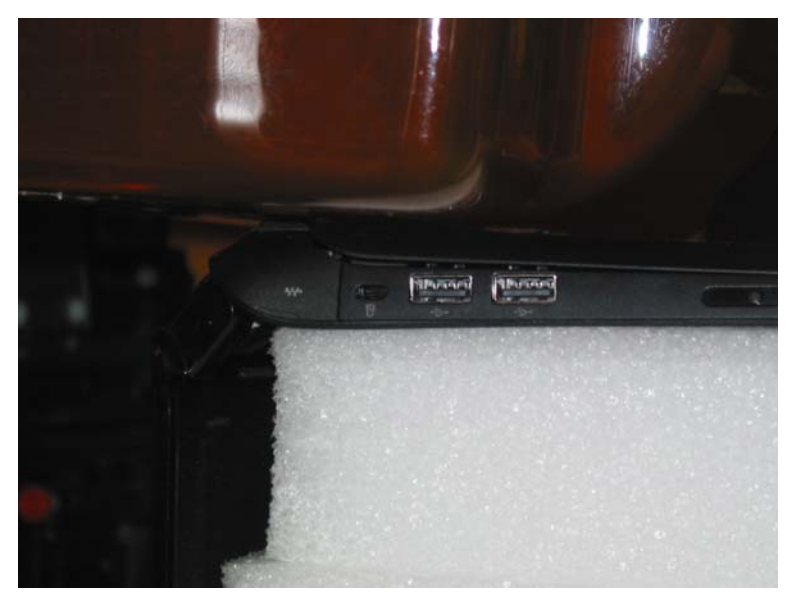
Bottom Test Position 0 mm Gap