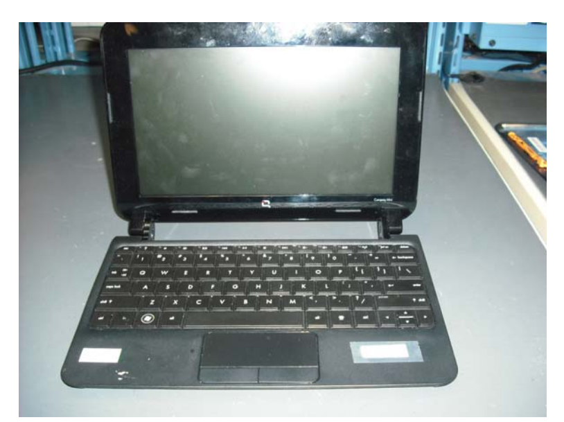
Front of Device