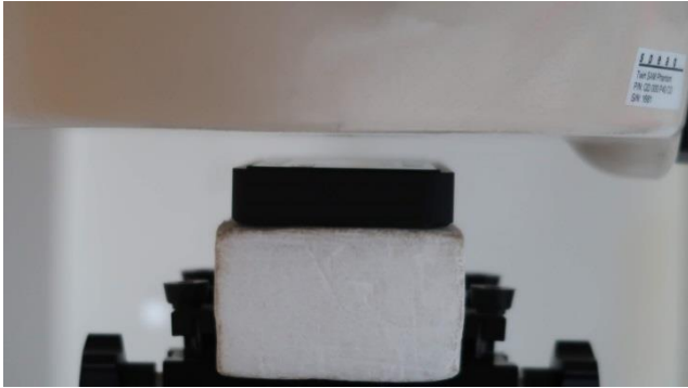
Front, Test Separation 10 mm