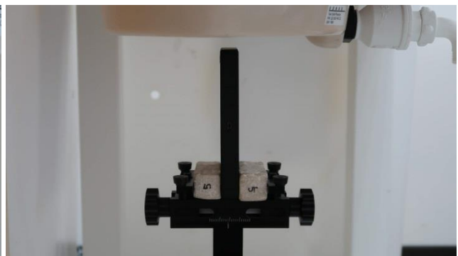
Right Side, Test Separation 10 mm