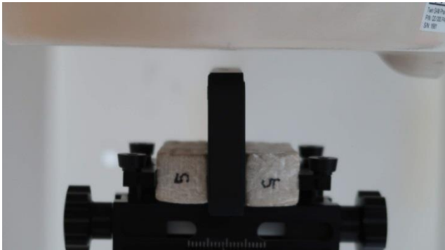
Top Side, Test Separation 10 mm