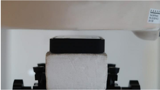
Front, Test Separation 10 mm