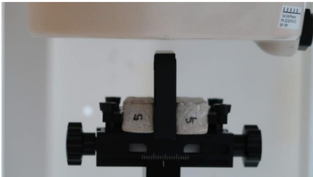
Bottom Side, Test Separation 10 mm