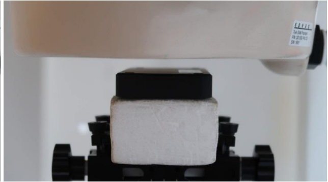
Back, Test Separation 10 mm