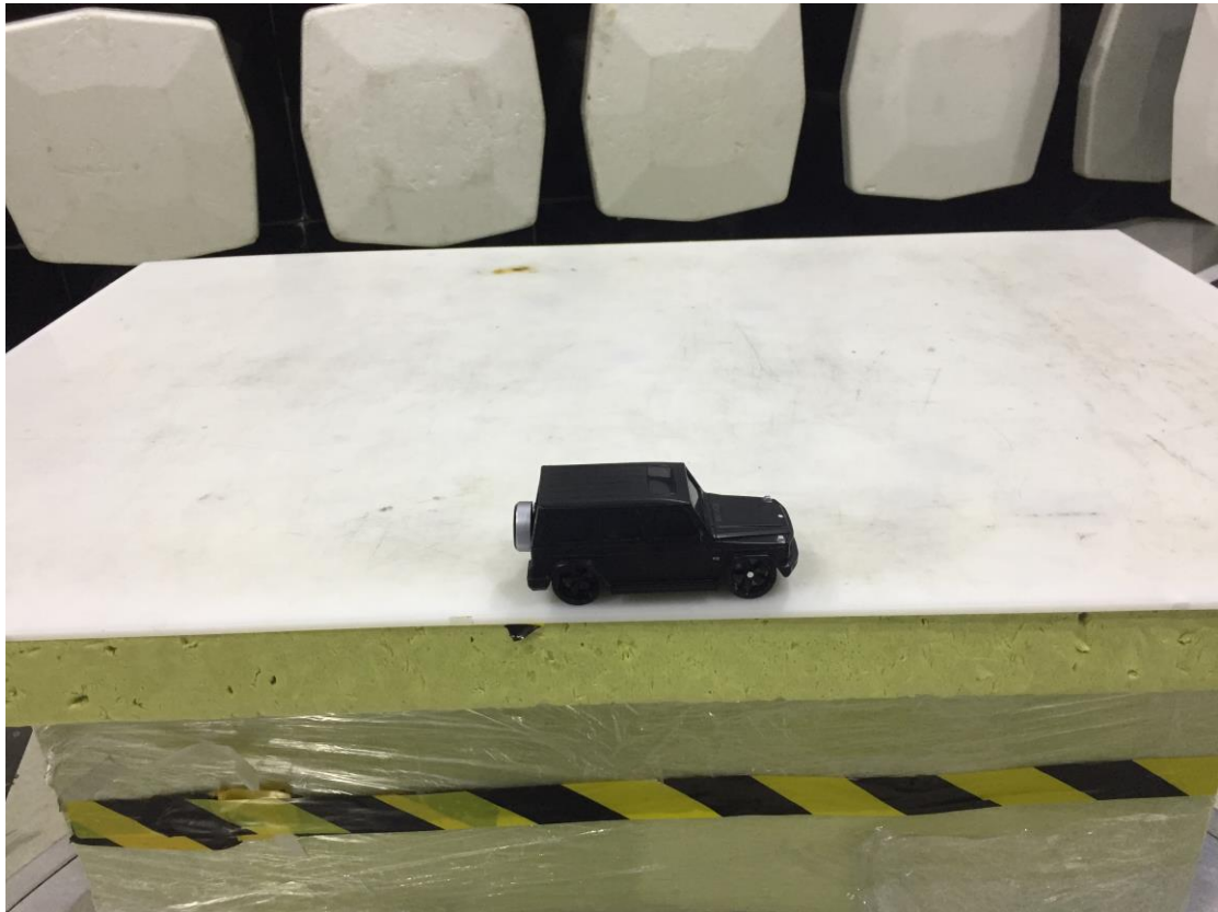
Up to 1GHz (The EUT placed at the center of the turntable)