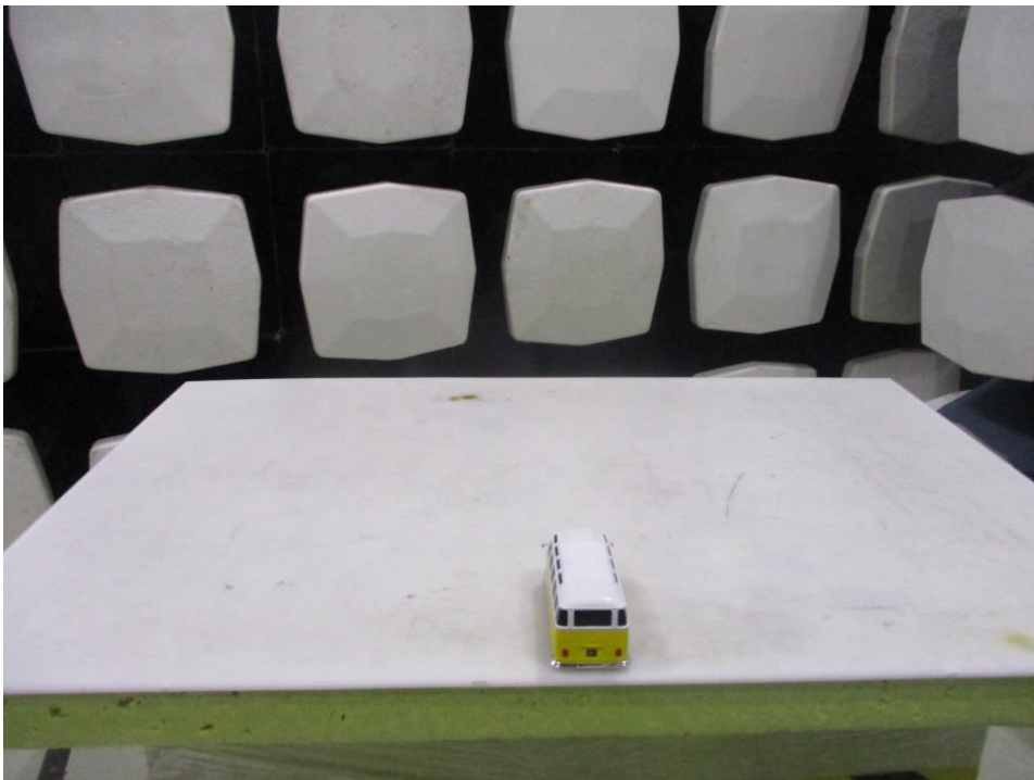
Up to 1GHz (EUT was placed in the centre of the turntable)