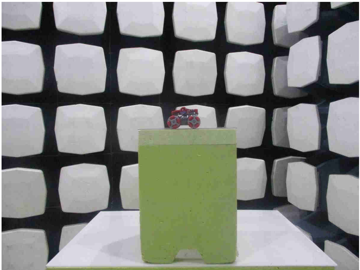
Above 1GHz (The EUT placed at the center of the turntable)