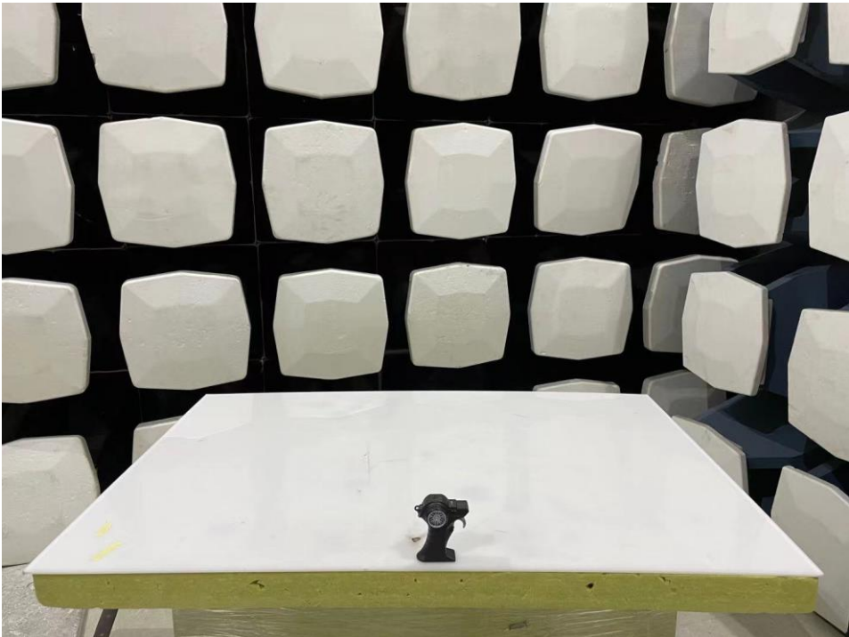
Up to 1GHz (EUT was placed in the centre of the turntable)