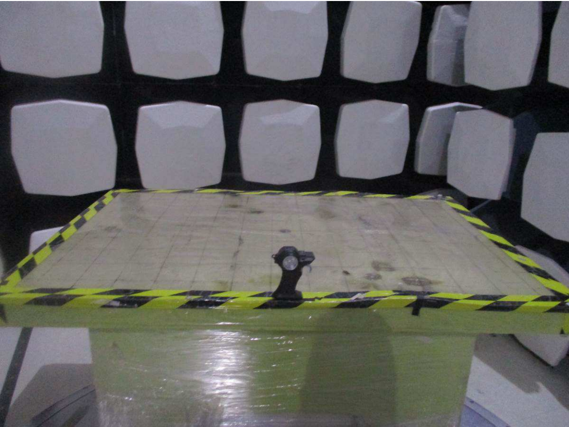
Up to 1GHz (EUT was placed in the centre of the turntable)