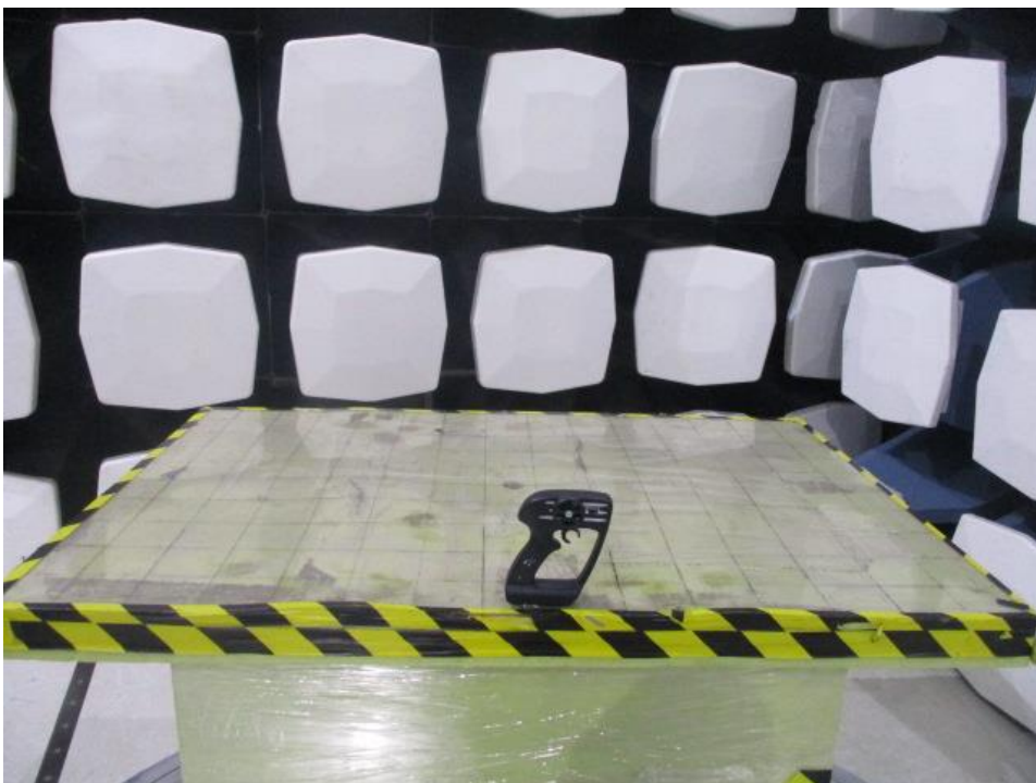
Up to 1GHz (EUT was placed in the centre of the turntable)