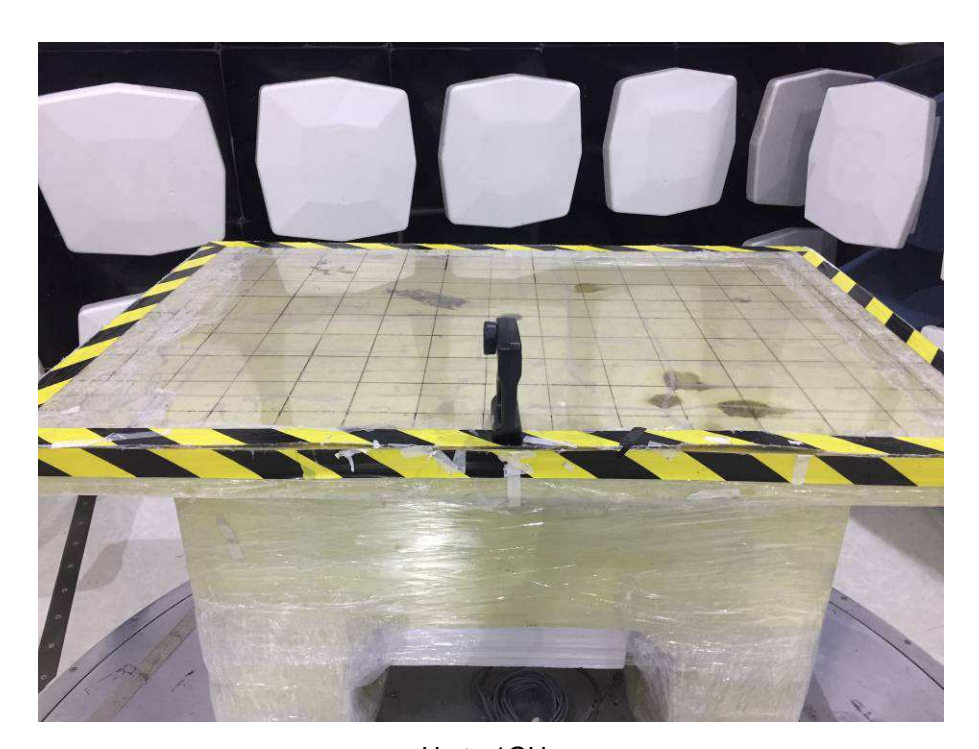
Up to 1GHz