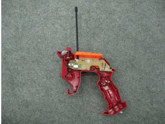
Front View of the product (Internal)