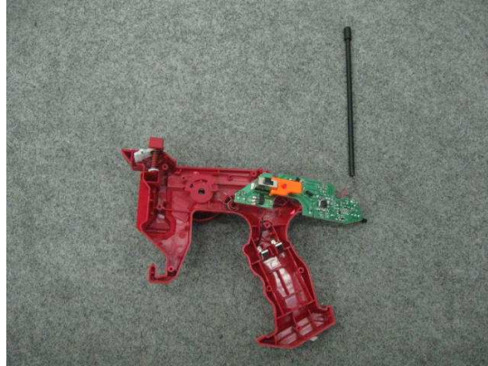
Rear View of the product (Internal)