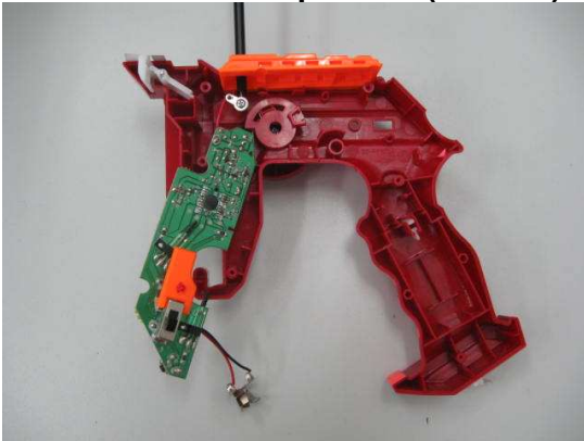
Front View of the product (Internal)