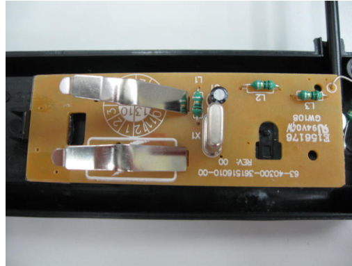
Inner Circuit Bottom View