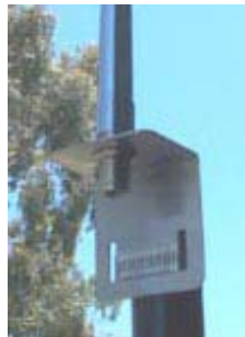
MB-100 Optional mast mount