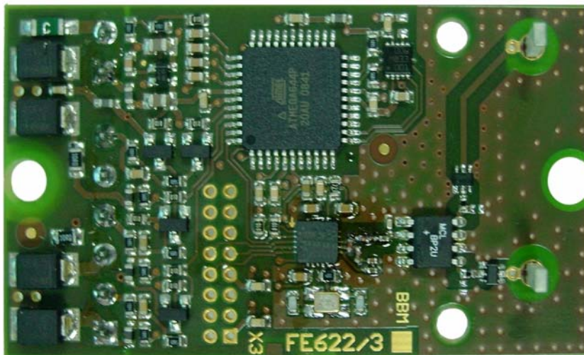
Component Side Radio Board FE622/3