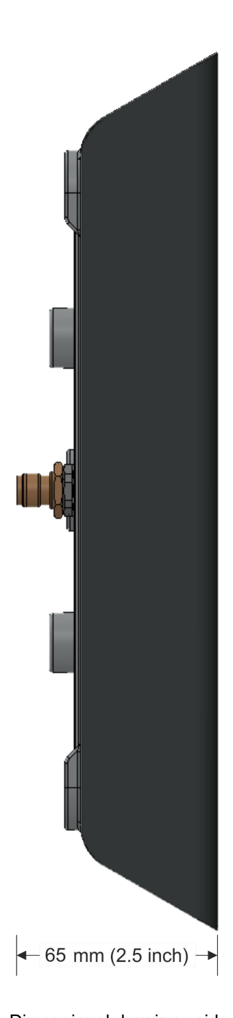
Fig. 2: Dimensional drawing - side view