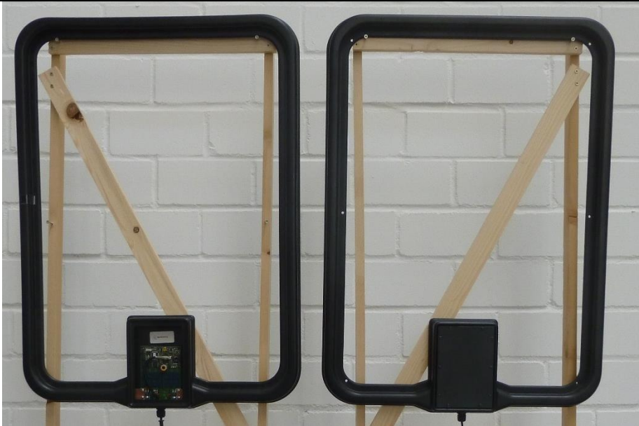
80 cm x 60 cm loop antenna