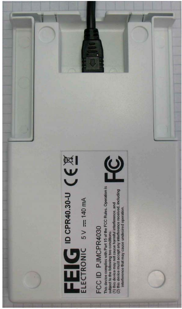
Rear of unit