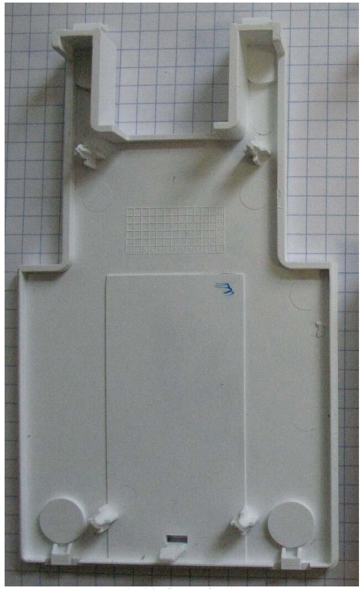
Inside Rear of unit