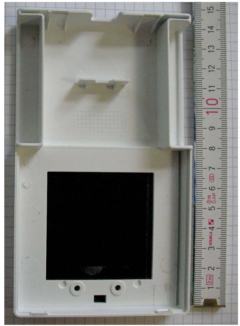
Inside Front of unit