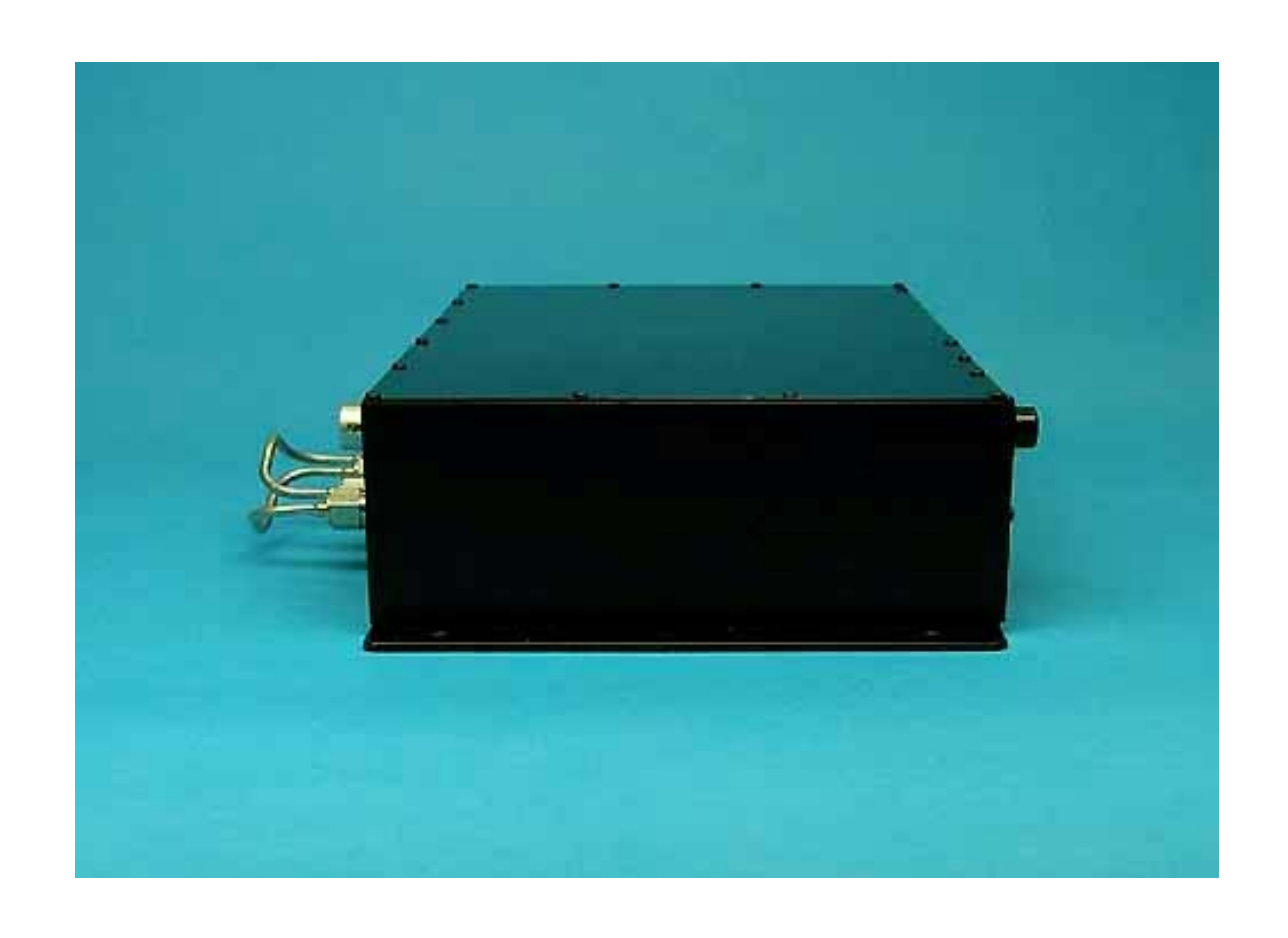
End View 2