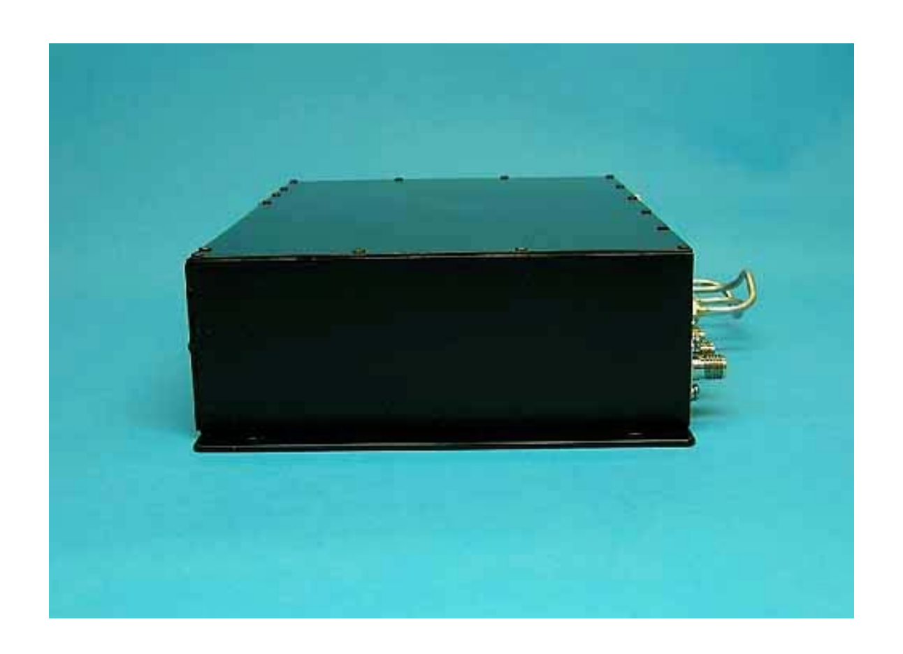
End View 1