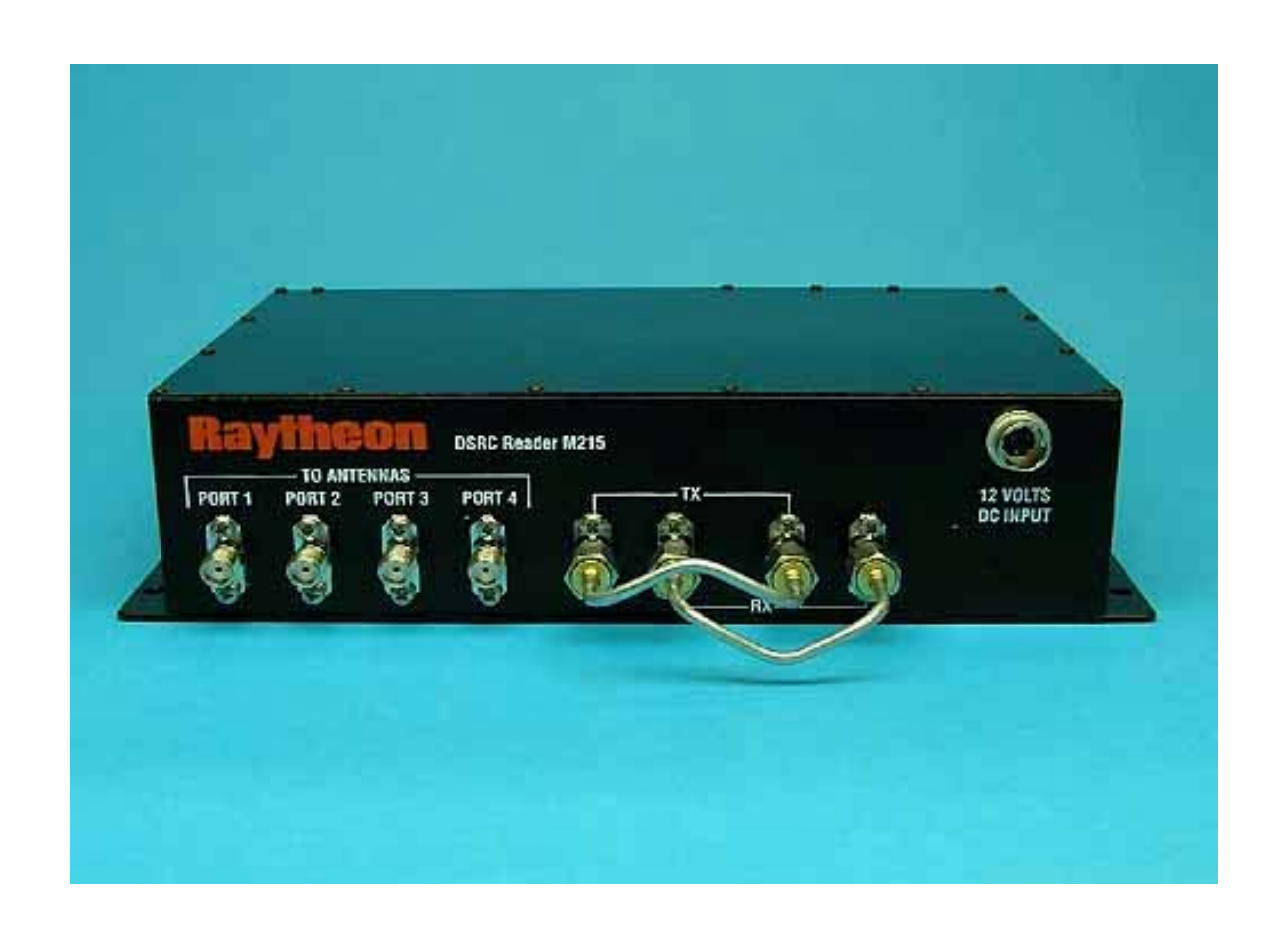
RF Interface and Input Power