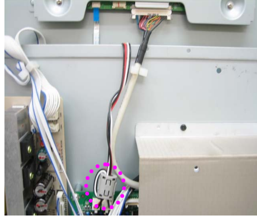
2. Attached the Core