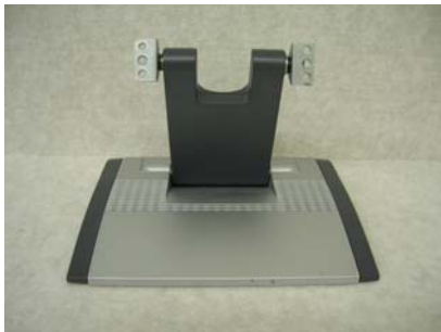
( Before Stand change)