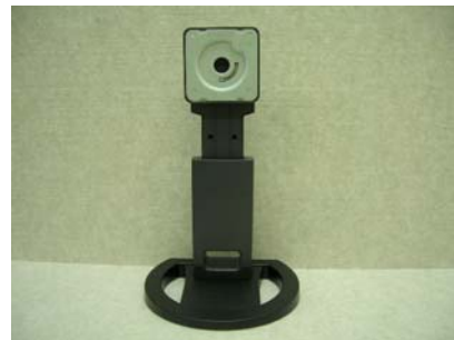
(After Stand change)

Attached is the applicant's Cover Letter, External / Internal Photo, Test Set-Up Photos, and Test Report.