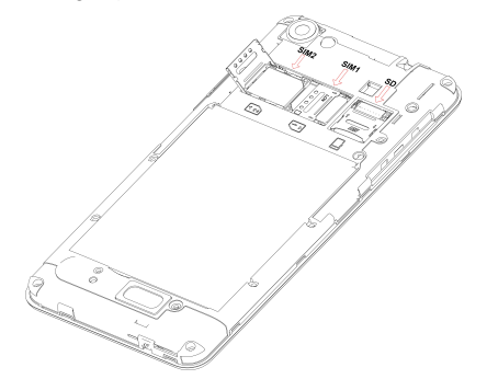
SIM Slot 1: Micro SIM card slot SIM Slot 2: Micro SIM card slot

Please make sure that the phone is powered off before proceeding: Open card slot, then install Micro SIM card