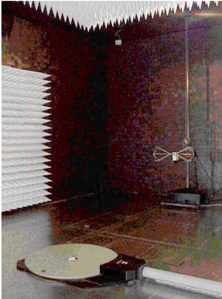
Figure 1 View from within chamber showing turntable base and mast set-up.