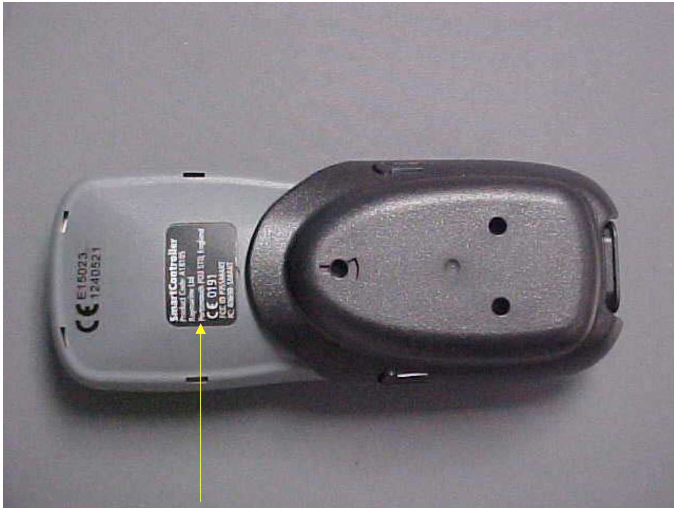
Smart Controller: FCC and IC label location