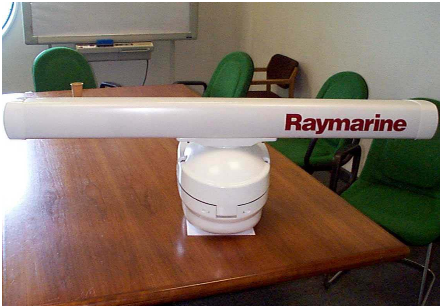
4kW, 48" Open Array Scanner Unit

Raymarine Limited. Registered in England. Company No. 1177969 Registered Office: Anchorage Park, Portsmouth PO3 5TD