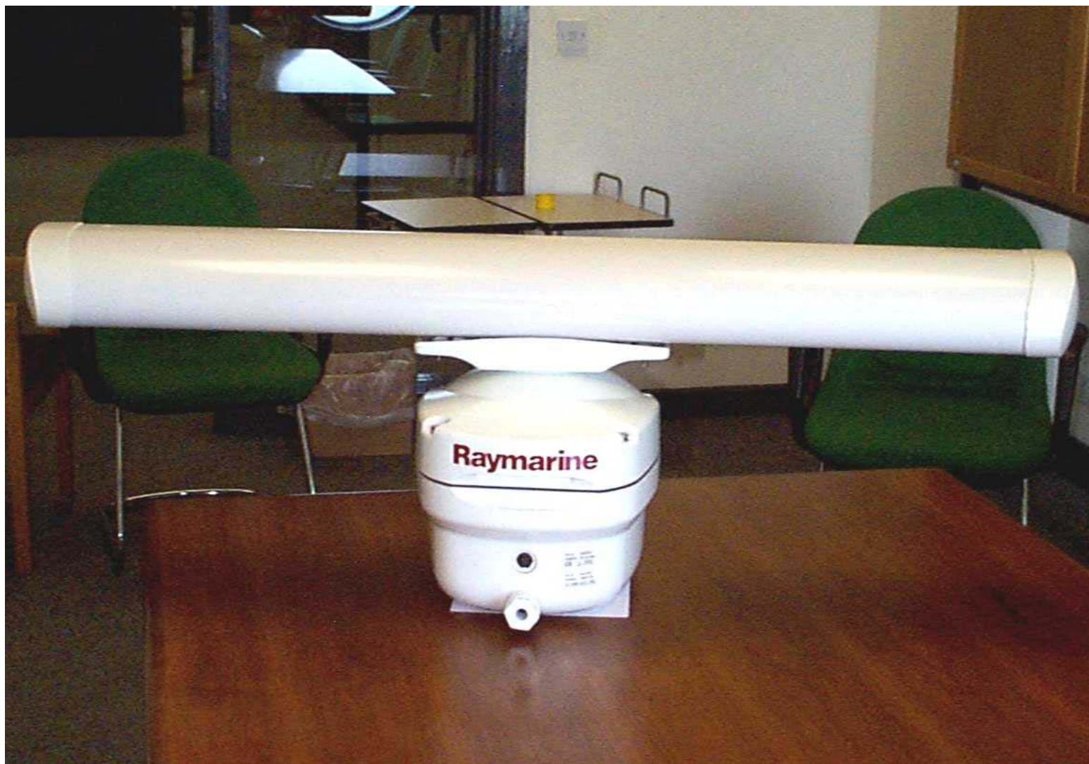
4kW, 48" Open Array Scanner Unit

Raymarine Limited. Registered in England. Company No. 1177969 Registered Office: Anchorage Park, Portsmouth PO3 5TD