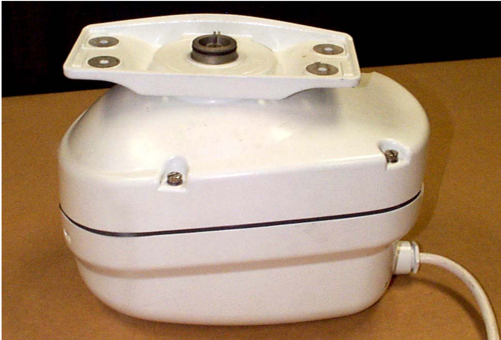
4kW or 10kW Pedestal Unit

Raymarine Limited. Registered in England. Company No. 1177969 Registered Office: Anchorage Park, Portsmouth PO3 5TD